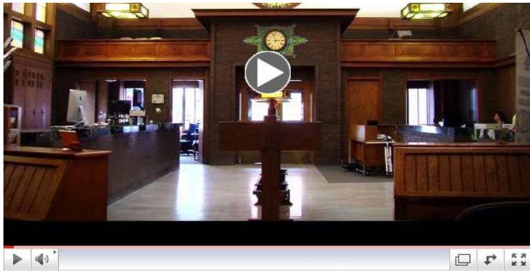
Jewel Box Bank/Merchants National Bank Historic Tour - Grinnell, Iowa

GRINNELL COLLEGE: Administrative Support Assistant, Assistant Director of Dining Services, Assistant Director of the Pioneer Fund for Reunion Giving, Associate Director of Academic Technology, Associate Vice President for Student Affairs, Case Manager, Director of Corporate, Foundation, and Government Relations, Information Technology Desktop Systems Specialist, Information Technology and Audio Visual Support Specialist. Library